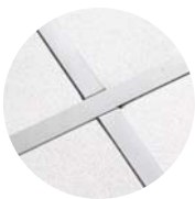
OPTRA Square Edge with Peakform 24mm Exposed Tee Grid