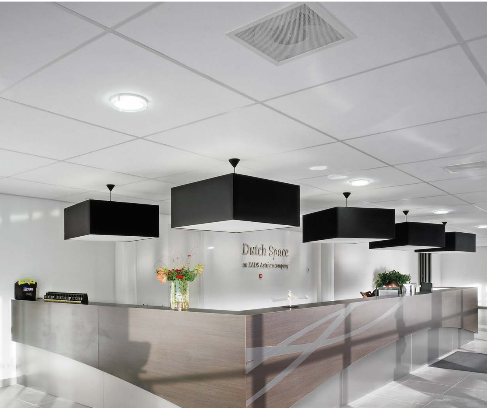
OPTRA Open Plan Square Lay-in with Peakform 24mm Exposed Tee grid